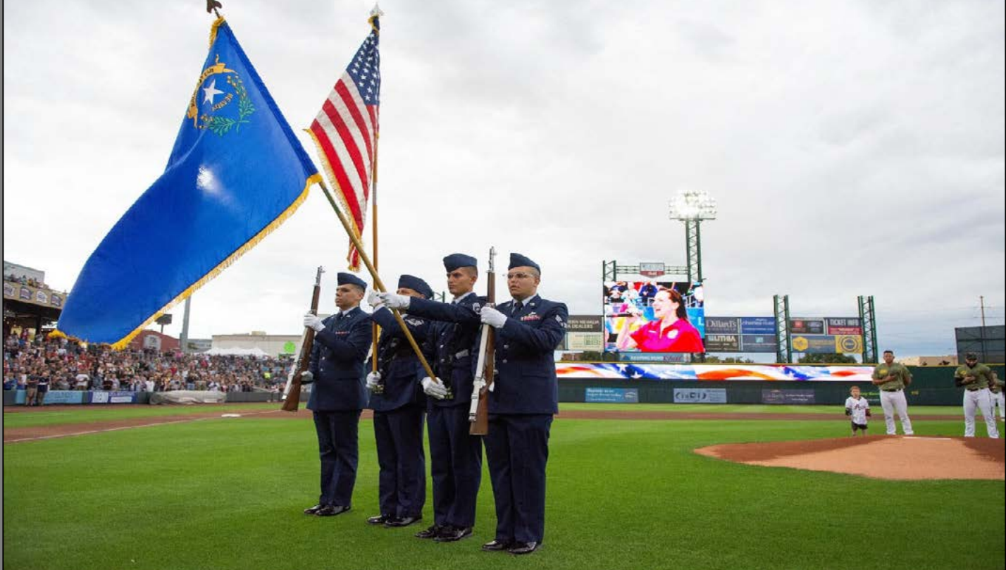
Color Guard Presentation performed at the Greater Nevada Field for the Reno Aces.

Presenting Colors for on-base events such as promotions, retirements, change of command, award ceremonies and etc.