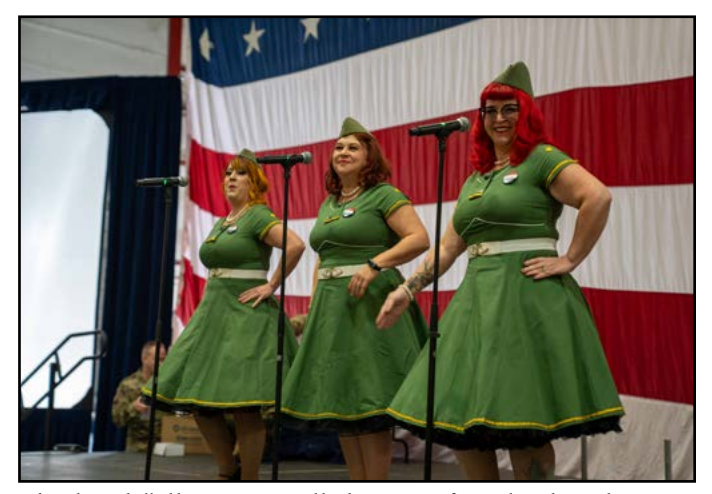
The local "all singing, all dancing female close harmony trio," known as the "Retro Radio Dolls" performed during the 2023 Outstanding Airmen of the Year Awards Ceremony on Jan. 7, 2024, in the Fuel Cell Hangar on the Nevada Air National Guard Base in Reno, Nev.

Other various awards, such as the Recruiter of the Year Award, Unit Career Advisor of the Year, Chief's Council Award, various Commander's Excellence Awards and the Adjutant General's Silver Sentinel Awards were also presented at the ceremony. Altogether 25 awards were presented to Airmen and sections across the 152nd Airlift Wing.