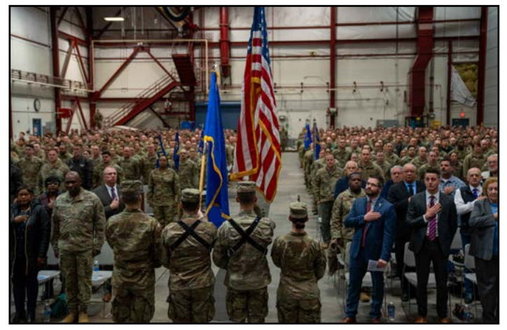
The Nevada Air National Guard Honor Guard Team presents the colors during the 2023 Outstanding Airmen of the Year Awards Ceremony on Jan. 7, 2024, in the Fuel Cell Hangar on the Nevada Air National Guard Base in Reno, Nev.

The Retro Radio Dolls , an all singing, all dancing female close harmony trio, added a festive touch with